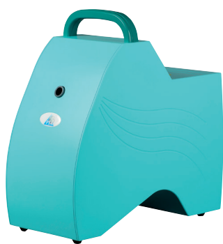
DAF-3000 Automated Diffuser