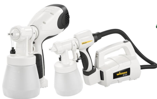
Manual Powered Sprayers